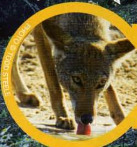
» Coyotes ◀

Desert coyotes have paler coats than their relatives in cooler places. The lighter color keeps them from soaking in as much heat from the sun.