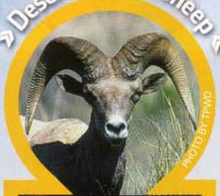
» Desert bighorn sheep ◀

Using their horns and hooves to remove cactus spines lets them get to the wet stuff inside.