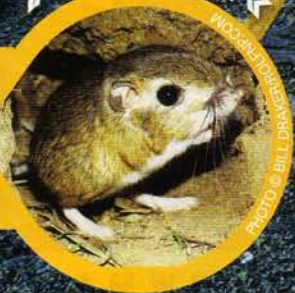
» Kangaroo rat ◀

Special microscopic tubes remove liquid from their urine (the official word for "pee") and turn it back into water!