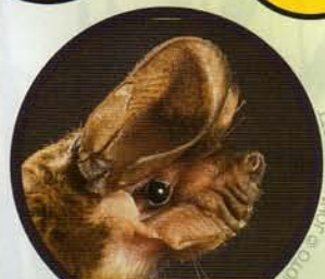
BIG FREE-TAILED BAT

In spite of its name, this animal doesn't eat cactus.